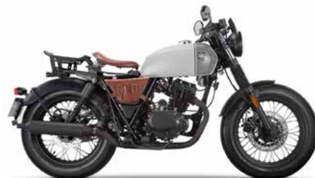
BULLET SILVER / TIMBERWOLF GREY