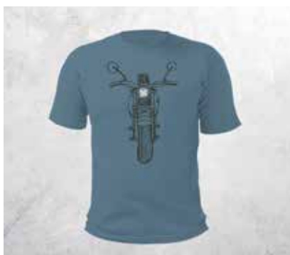
T-SHIRT X-LIGHT - HORIZON BLUE