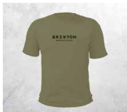
T-SHIRT COMPASS - MOSS GREEN