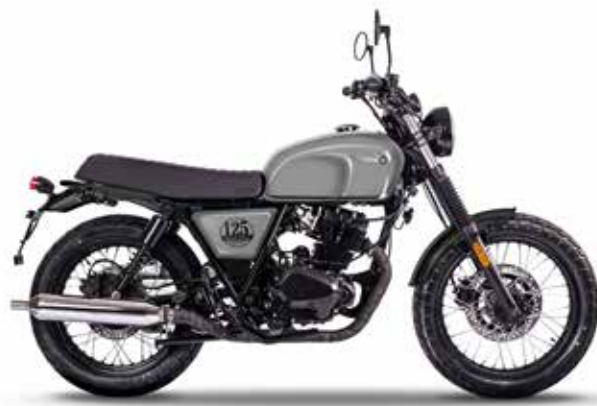
TIMBERWOLF GREY ²