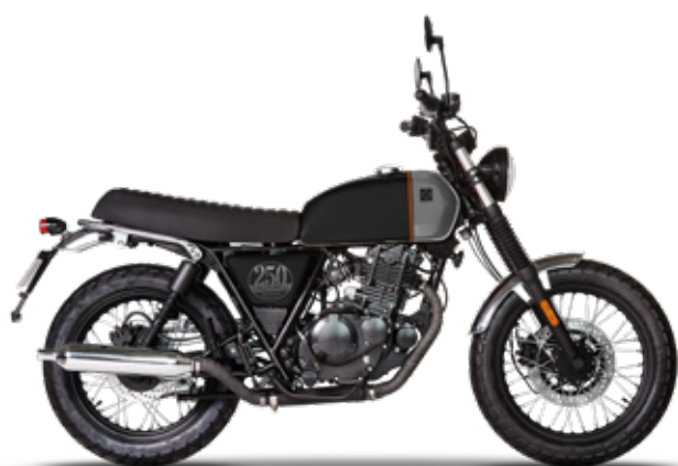
TITAN BLACK / STERLING GREY

KOSO LED indicators, LED beams front and rear plus, ABS brakes and adjustable rear shock absorbers as standard – the Cromwell 250 delivers all the specs that matter, so you can take on the road.