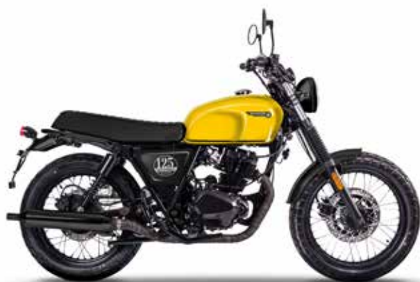
SUBMARINE YELLOW ²

² Standard equipment on Submarine Yellow and Timberwolf Grey Cromwell 125 models