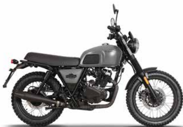
TIMBERWOLF GREY 1