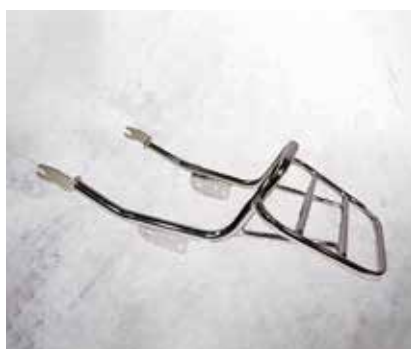
REAR CARRIER BLACK, CHROME