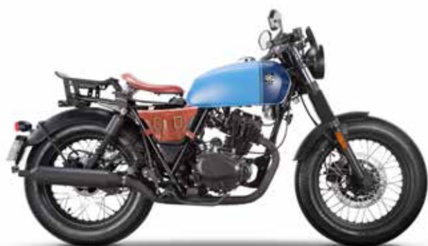
ROYAL BLUE MATT / HORIZON BLUE MATT

*according to Commission Delegated Regulation (EU) 134/2014, Annex VII