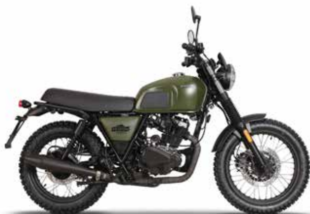
CARGO GREEN 1