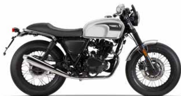
BULLET SILVER / BACKSTAGE BLACK

*according to Commission Delegated Regulation (EU) 134/2014, Annex VII