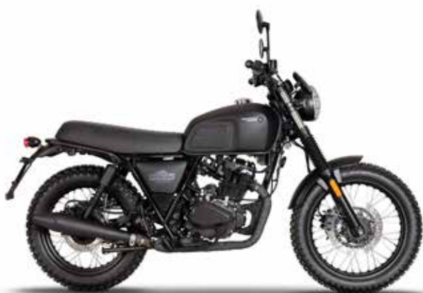
BACKSTAGE BLACK 1