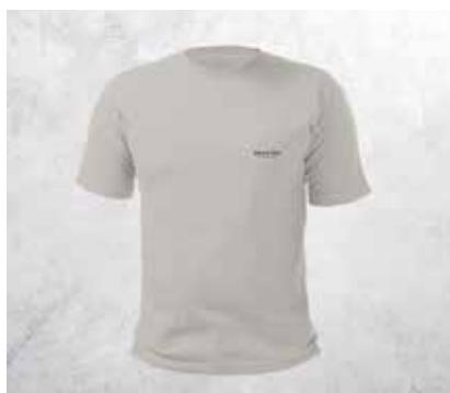
T-SHIRT COMPASS - LIGHT GREY

Follow your own style and put your Brixton motorcycle on the road the way you love it most. Choose from a variety of accessories including mufflers, colored tanks and cushions, and handlebars to create your own unique motorcycle that suits you best. For a detailed list visit brixton-motorcycles.com/parts