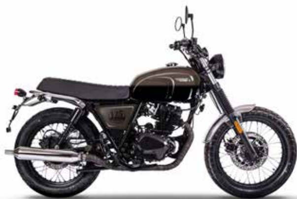
CHARLY BROWN / TITAN BLACK †