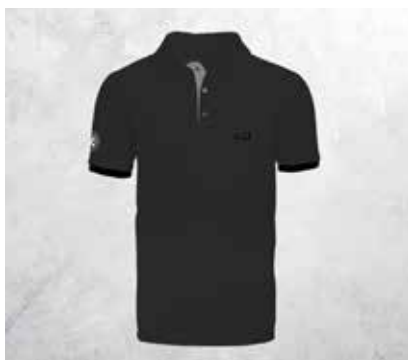
POLO CLASSIC - BACKSTAGE BLACK