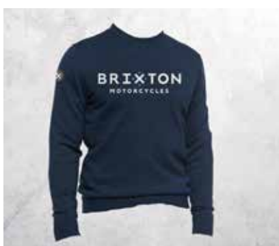
SWEATSHIRT BRIXTON PRINT