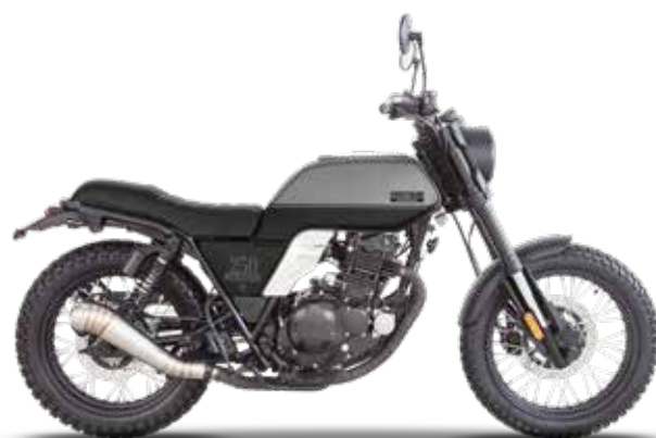
BACKSTAGE BLACK / TIMBERWOLF GREY