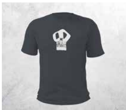
T-SHIRT SKULL - TIMBERWOLF GREY