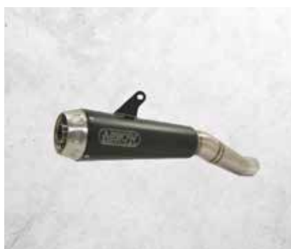
ARROW MUFFLER STAINLESS STEEL/BLACK