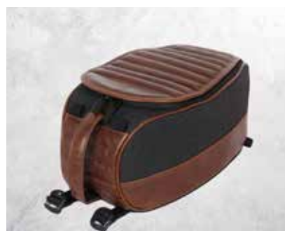
FUEL TANK BAG (CROSSFIRE 500)