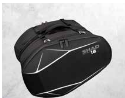
SHAD SIDE BAGS (CROSSFIRE 500)