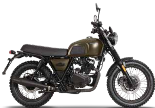
CHARLY BROWN 2