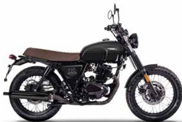
BACKSTAGE BLACK / TITAN BLACK †