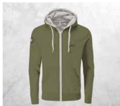
ZIP HOODIE COMPASS