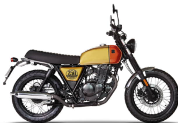
DESERT GOLD / CLOCKWORK ORANGE