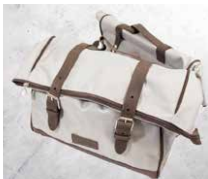
SIDE BAGS INKL. BRACKET