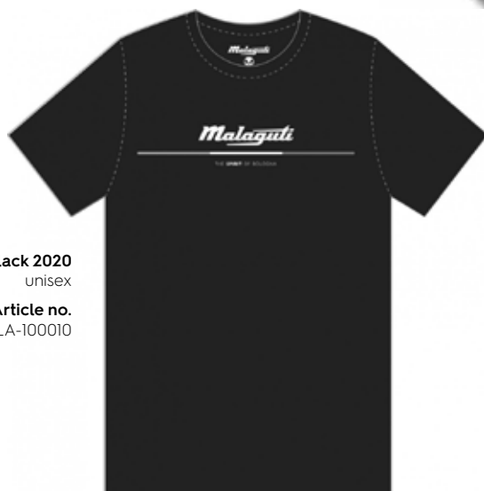
Flag Shirt black 2020