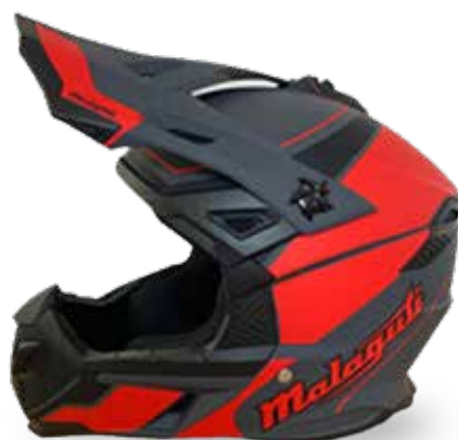
Helmet Malaguti Offroad