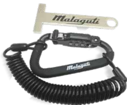
Helmet lock Malaguti