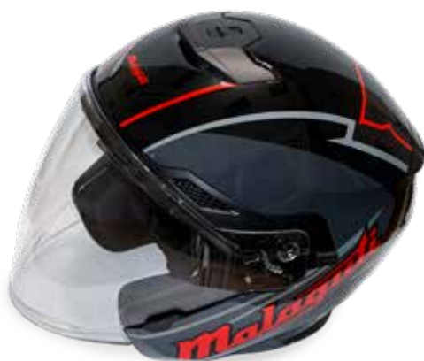
Malaguti full face helmet